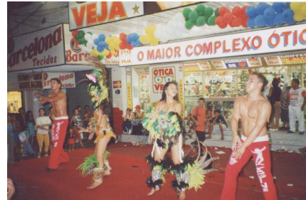
Artistic fervor and color are important parts of the vibrant lifestyle of Brazil.