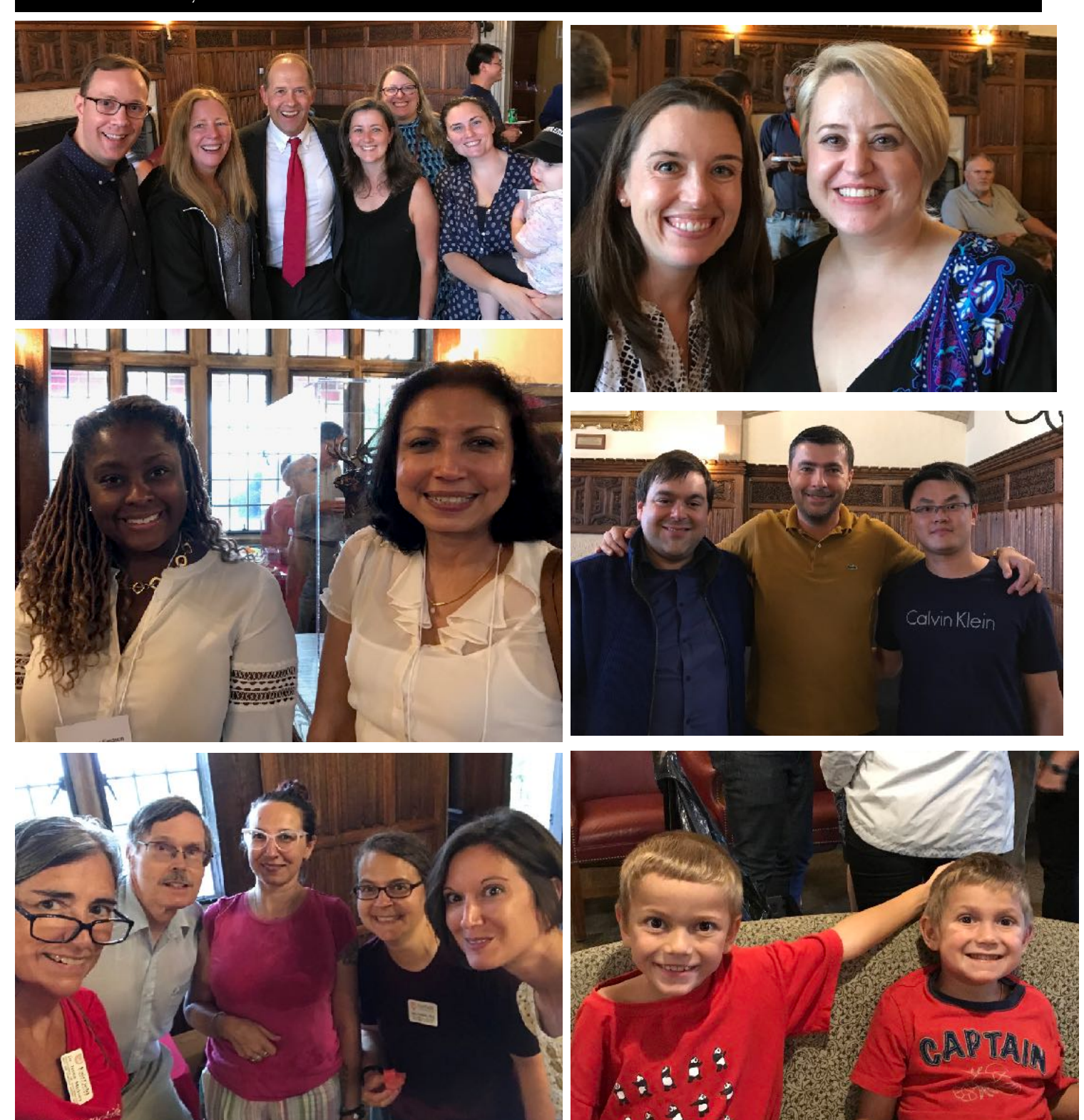
(Bottom left: the fabulous set-up crew. We are a lot wetter than we look.)