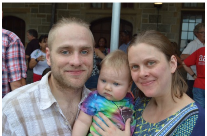
Colleagues & Family