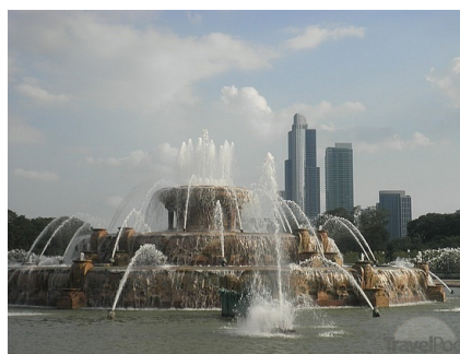
Buckingham Fountain, Grant Park, Chicago - just steps away from the 2012 SI