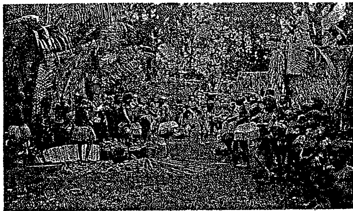
SCENE IN YOURAWOTU (TROBRIANDS)

An everyday scene, showing groups of people at their ordinary occupations. (See p. 7.)