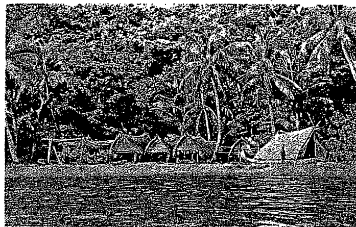
THE ETHNOGRAPHER'S TENT ON THE BEACH OF NU'AGASI

This illustrates the manner of life among the natives, described on p. 6. Note (with reference to Chs. IV and V) the dug-out log of a large canoe beside the tent, and the masawa canoe, beached under palm leaves to the left.