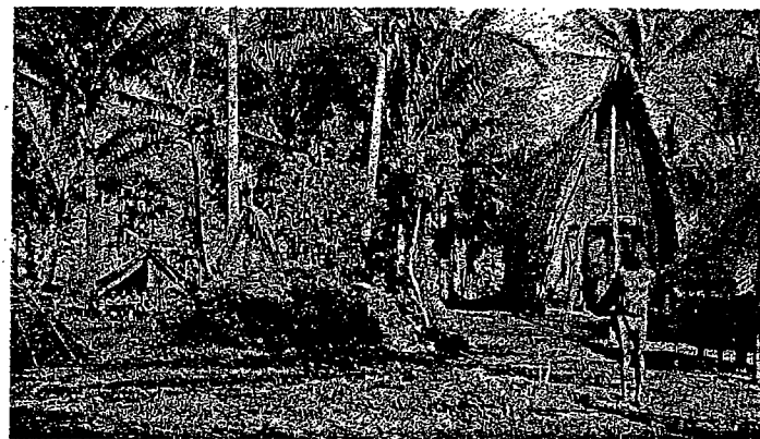
THE CHIEF'S LISIGA (PERSONAL HUT) IN OMARAKANA