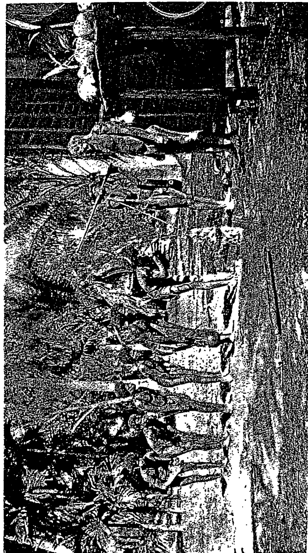
A CEREMONIAL ACT OF THE KULA (See p. 472)