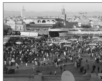
The village where Crawford works in the countryside (L), and the noise of the market of Marrakech (R).

Men and women weather quickly—decades before their wealthier counterparts in the city. Girls and